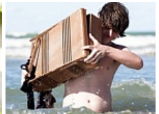
You won't believe what this airline did with his luggage!