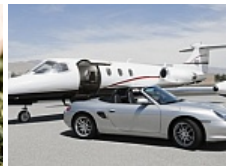
The most expensive things you don't need!