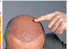
Unique Method Regrows Lost Hair (Do This Daily)