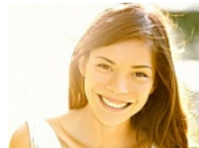
10 ideas for a great first date