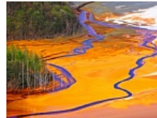
These are the most toxic places on earth. You'll never believe #5!