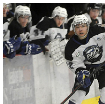
Pilots take control of series