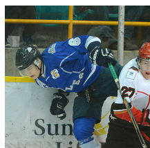
Down to the wire for 'Dogs