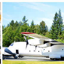
Gov't tries jets over prop planes for aerial firefighting