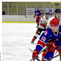
Generals just miss wild card