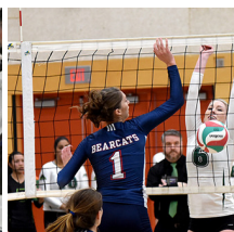
Cascades set for Provincials