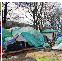
Moving day looms for tent city