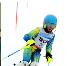
Mission athletes head to BC Games