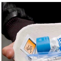
Toronto moves toward safe-injection sites