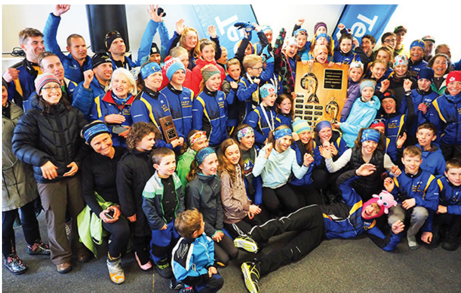
Celebration time: Members of the Larch Hills Nordics cheer after being presented with the overall club championship.