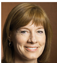
Ex-provincial staffer charged in email affair