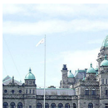
Lead from old pipes hits home for MLAs