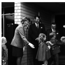
Famous faces in West Kootenay/Boundary