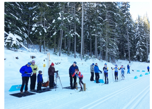
Racers at the start line at Mount Macpherson.