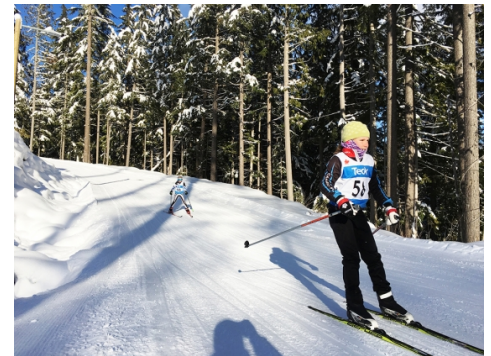
Racers compete on the trails.

From outside of the Okanagan there were a few racers from Canmore Nordic and two racers from Australia's New South Wales Cross-Country Ski Club. Racers from our home club did tremendously well. Many racers from Revelstoke placed in the top five, as listed below: