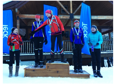
On the podium.