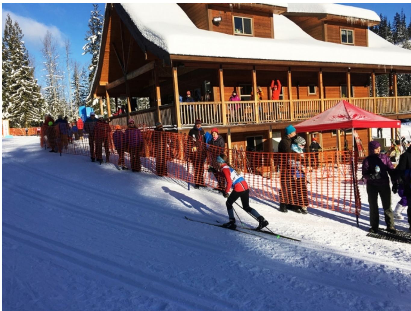
A racer skis past the Nordic Ski Lodge at Mount Macpherson during an Okanagan Cup race on Saturday.

By Revelstoke Mountaineer staff - Jan 4, 2016