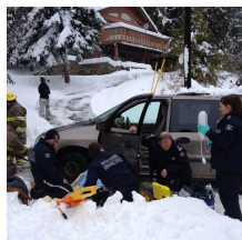
Man airlifted to hospital after being pinned under car