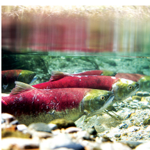
Chase: Looking back at 2014