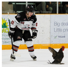
KIJHL: Wild times in Fernie