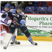
Snakes slide past Sprucies