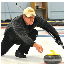
Releasing the rock