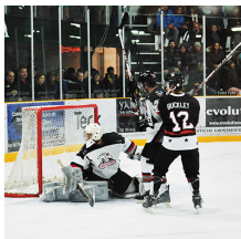
KIJHL: Dynamiters fall in Fernie