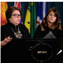
Calls for missing-women inquiry go global