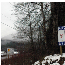
Hitchhiking study looks to expand information base