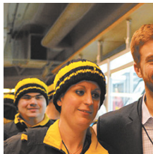
Locals help open Special Olympic Winter Games