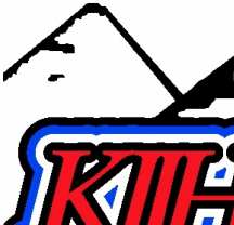
Rebels one win away from advancing