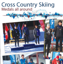
Cross Country Skiing