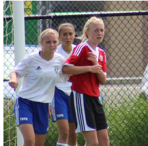
Whitecaps link up with TOFC