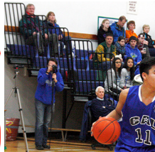
No. 4 Rainmakers prepare to host zones