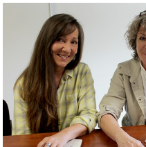
An experience of shared living