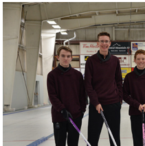
Curlers training to rock in Penticton