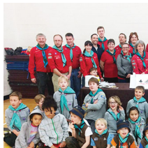
Scouts, Guides revive Hike for Hunger