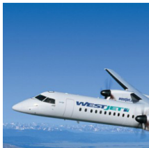
WestJet passengers take long way home to Terrace, B.C.