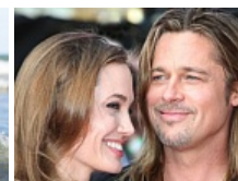
You Won't Believe Who Tops the List as the Most Generous Celebrity!