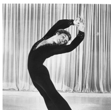
Legendary skater Toller Cranston dead at 65