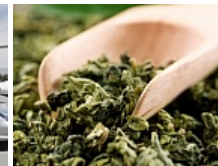
These 12 super foods speed up your weight loss and melt fat as soon as you start eating them!