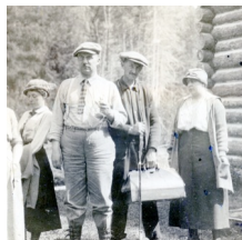
Hot history: A look back at the development of the Lakelse hot springs