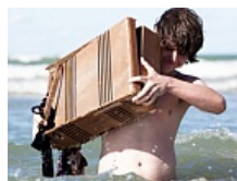
You won't believe what this airline did with his luggage!