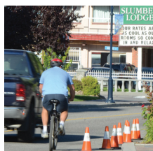
New speed limit drops in downtown