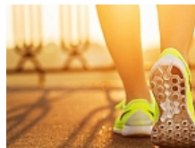
These tips will keep you motivated and help you achieve your weight loss goals!