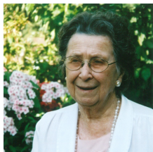
Nelson's oldest citizen passes