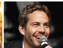
These Celebrities changed our lives forever, but left too soon.