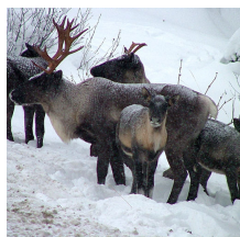
Wolf kill last hope for BC caribou herds