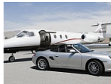
The most expensive things you don't need!